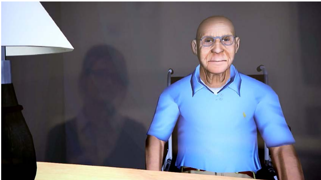
Figure 1. Jim, the virtual patient, as seen from the perspective of a student trainee.

The simulation training platform was built with the Unity game engine, an advanced state-of-the-art virtual reality development software platform that supports full 3D graphic rendering, physics, and a wide variety of interaction device options. The Unity game engine, high fidelity visuals, and customised animations have been used to enhance the realism and credibility of the simulation content while offering a training experience that is uniquely designed to differentiate it from commercial videogames, static websites, or cartoon like characters. The program includes two simultaneous, run-time applications. The controller application is a run-time controller user interface (UI) and is operated by a human user. It includes a library of verbal and non-verbal options activated by a click of the mouse. A second application is designed and customised for the intended user to interact with in real time and it includes a single virtual patient, with customised demographic characteristics (e.g., gender, attire, ethnicity, body shape, facial features) defined by the clinical team from the university, as well as a location/context (e.g., clinic office) with typical location specific content (e.g., tables, chairs, lamps, ambient sounds, wall furnishings). All language, gestures, motions, and verbal and non-verbal content in the virtual human is controlled by the controller UI.