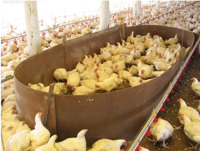
Figure 1. Handling and Penning of birds. Pen approximately 25 birds in an area of the house.

Gait Score 5 - The bird is incapable of sustained walking.