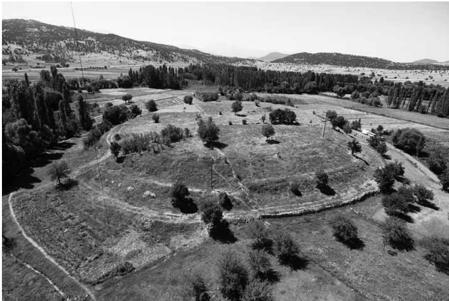
Figure 5.2: Çaltılar in its landscape.

The ancient settlement mound ( höyük ) is situated just to the south of the modern village (the origins of the modern village date to the 1920s, when it and three other