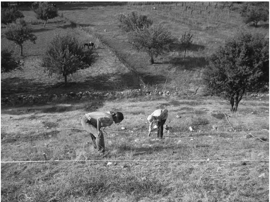
Figure 5.3: Intensive collection survey.

The volume of material from any given square was largely determined by recent post-deposition activities, as suggested by a secondary study conducted in 2009, in which two ten by ten meter areas walked in 2008 were re-walked, and individual finds were plotted using a total station. One area had been subject to plowing, and the other not but had evidence of extensive mole activity (which is common at the site). The number of artifacts in each was similar to the quantity collected from each the previous year, and their respective distribution accorded with the method by which