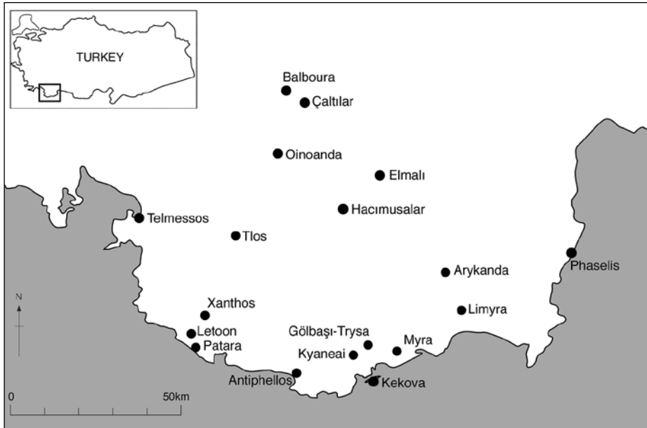
Figure 5.1: Map of Lycian sites mentioned in the text (drawing S. Grice).

expedition to retrieve these antiquities for the museum. Fellows returned in 1840, although the firman for removal was not secured, and he returned empty handed.