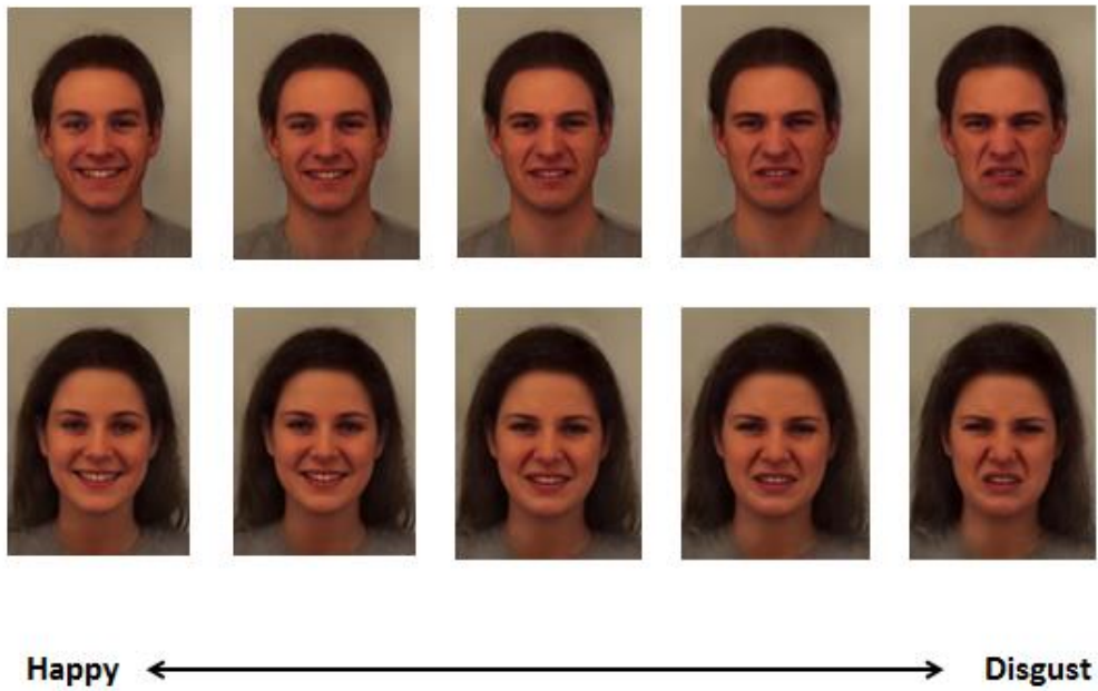
Figure 2 Examples of stimuli from the emotion recognition training program