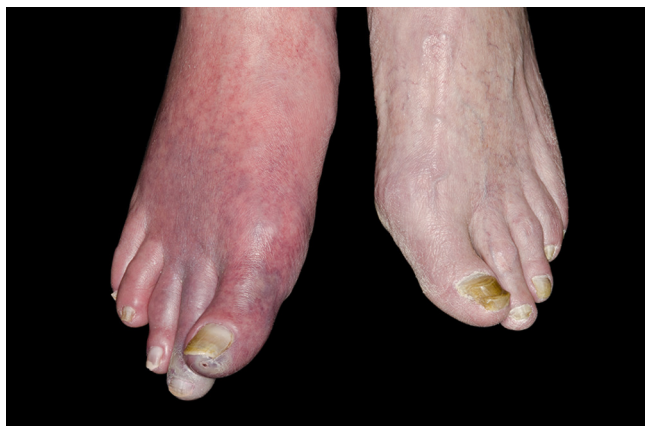
Fig 1 Ischaemic right foot demonstrating discoloration and tissue loss at the tip of the hallux