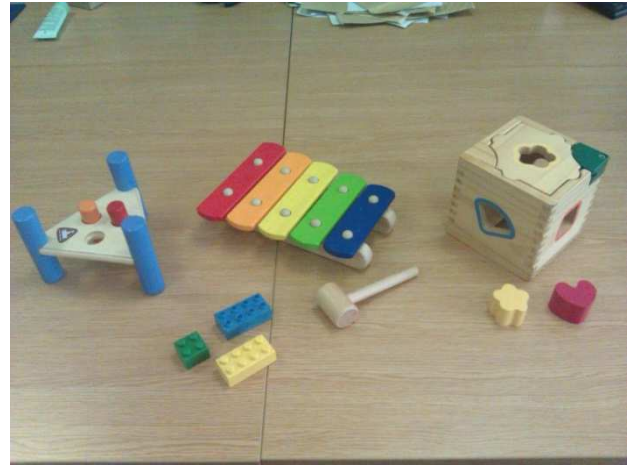
B) Functional Session