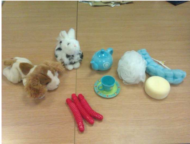
5 A) Pretend Session