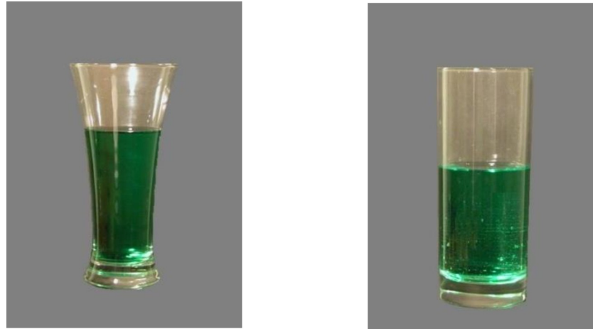
Fig 1. Curved (A) and straight (B) glasses used both poured to 50% capacity.

https://doi.org/10.1371/journal.pone.0204562.g001