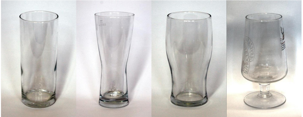
Fig 3. Straight (A), curved (B), tulip (C) and inverted (D) pint glasses.

https://doi.org/10.1371/journal.pone.0204562.g003