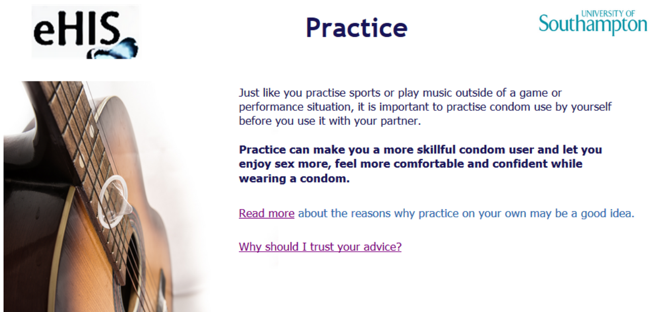
Figure 1. An example of a page on the Homework Intervention Strategy (eHIS) website.