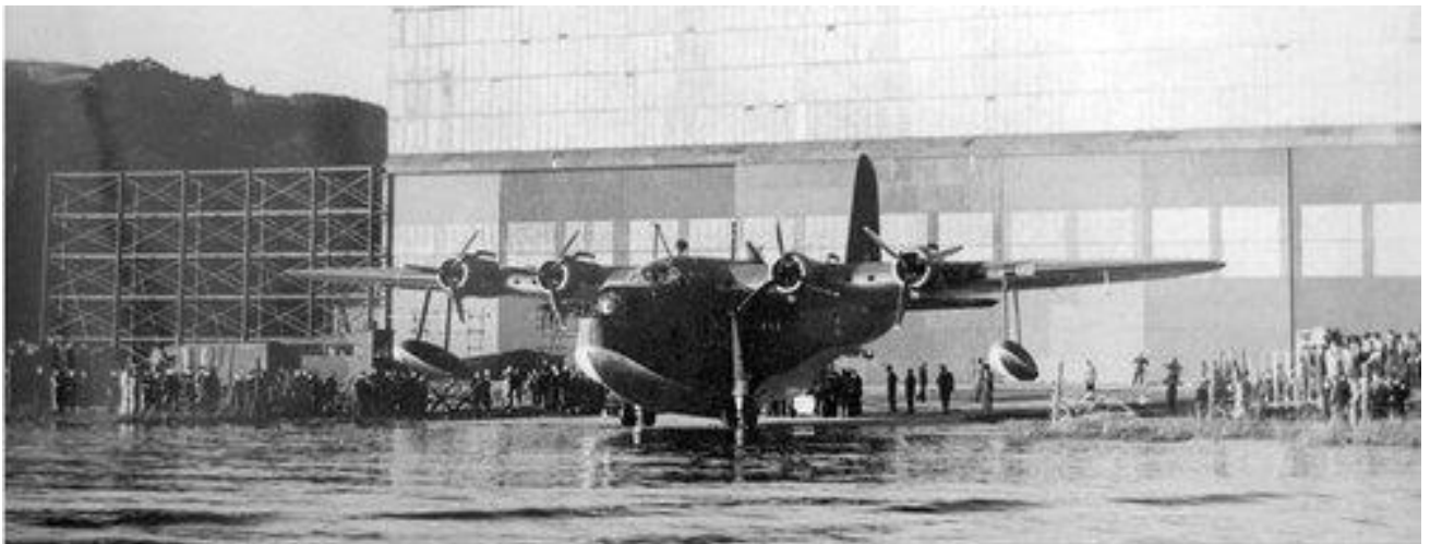
DP176 seaplane ready to launch at the Windermere factory; note Lake District hills to the left 97