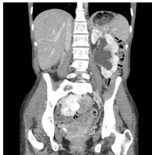
Fig. 1 CT urography image shows bilateral gross hydronephrosis with congenital pelvic right kidney

Bladders that are defunctionalized early in life because of congenital obstruction like posterior urethral valves, result in