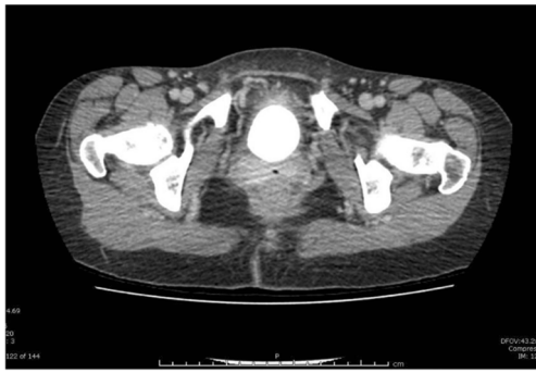
Fig. 2 CT urography image shows a small shrunken bladder with diffuse wall thickening

reduced bladder capacity and never resume their function. The hypertonicity and irritability are greater in the congenital obstructed bladder when compared with the acquired obstruction [22]. Early intervention or obstruction repair in infants with congenital obstructive lesions avoids the complications of a contracted bladder later in life.