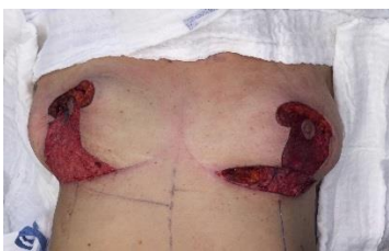
D: Bilateral reduction mammoplasty with inferior pedicle