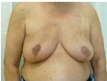
E: Patient one year after surgery