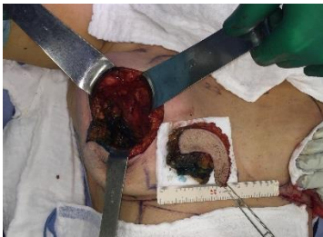
C: Right oncoplastic supraareolar en bloc tumorectomy