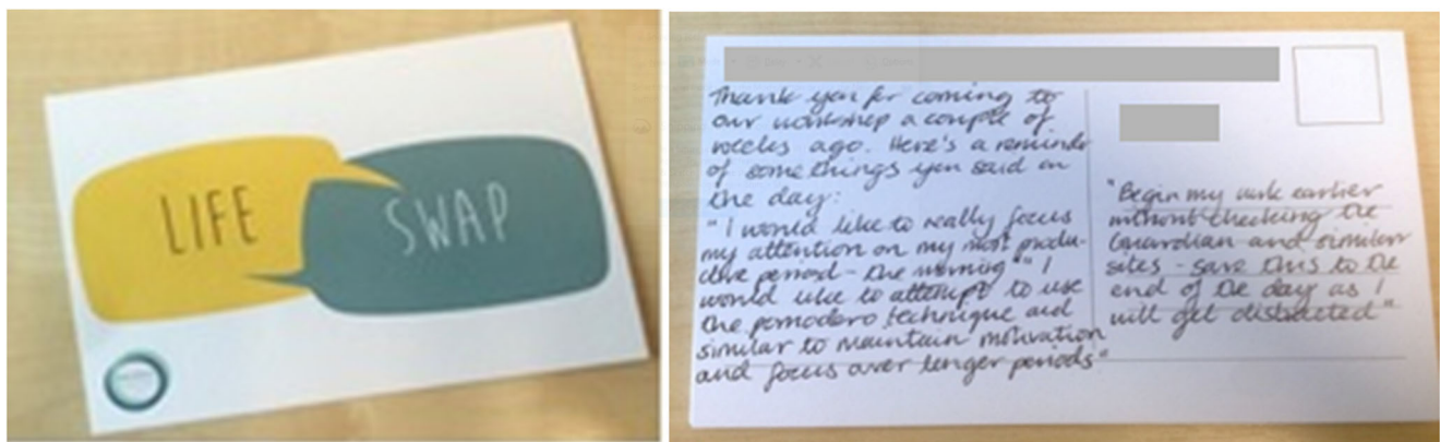
Fig. 3 Post-cards sent to participants 2 weeks after the study

Each of the 18 participants took part in two conversations, resulting in a total of 18 conversations (2 people per conversation, 2 conversations per person) across the three workshops, all of which were transcribed. Coding of conversation transcripts was then conducted using both inductive and deductive techniques for thematic analysis. Initial codes around