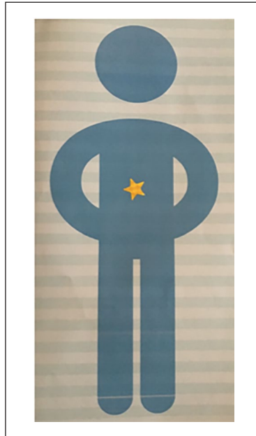
Figure 1. A younger child's description of their CFS/ME experience (Leo, KS1).