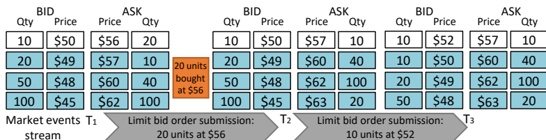
Fig. 1. A LOB of four price levels evolving with time. White and blue boxes indicate the top level and deeper levels of the LOB. Grey boxes indicate market events stream. Orange box indicates trade records. White and orange boxes together form TAQ.

original dataset. We find that: (i) LOBRM with continuous decay kernel is superior in modelling the irregularly sampled LOB; and (ii) the module ensembling of LOBRM is effective.