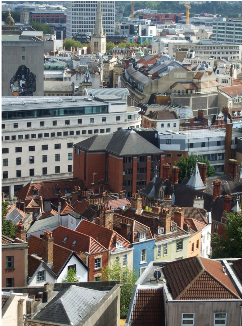
Figure 3. ST5873 : From the tower of St Michael on the Mount Without: Bristol city centre skyline 2019 showing modern tower blocks, ancient churches interspersed with Georgian and Victorian houses (now largely given over to offices).

pop. 12,000) to the north, as well as in more rural areas. The housing in these towns is similarly mixed. The seaside resorts of Weston-Super-Mare, Clevedon and Portishead became popular in the Victorian period (Roethe, 2020). These areas developed hugely post-war, along with old villages such as Thornbury and Chipping Sodbury with newer homes dating predominantly from the 1960s through to the 1980s. Yate, however, is considered a “new town”. Sparsely populated until the post-war period, a huge amount of building has occurred since the 1960s.