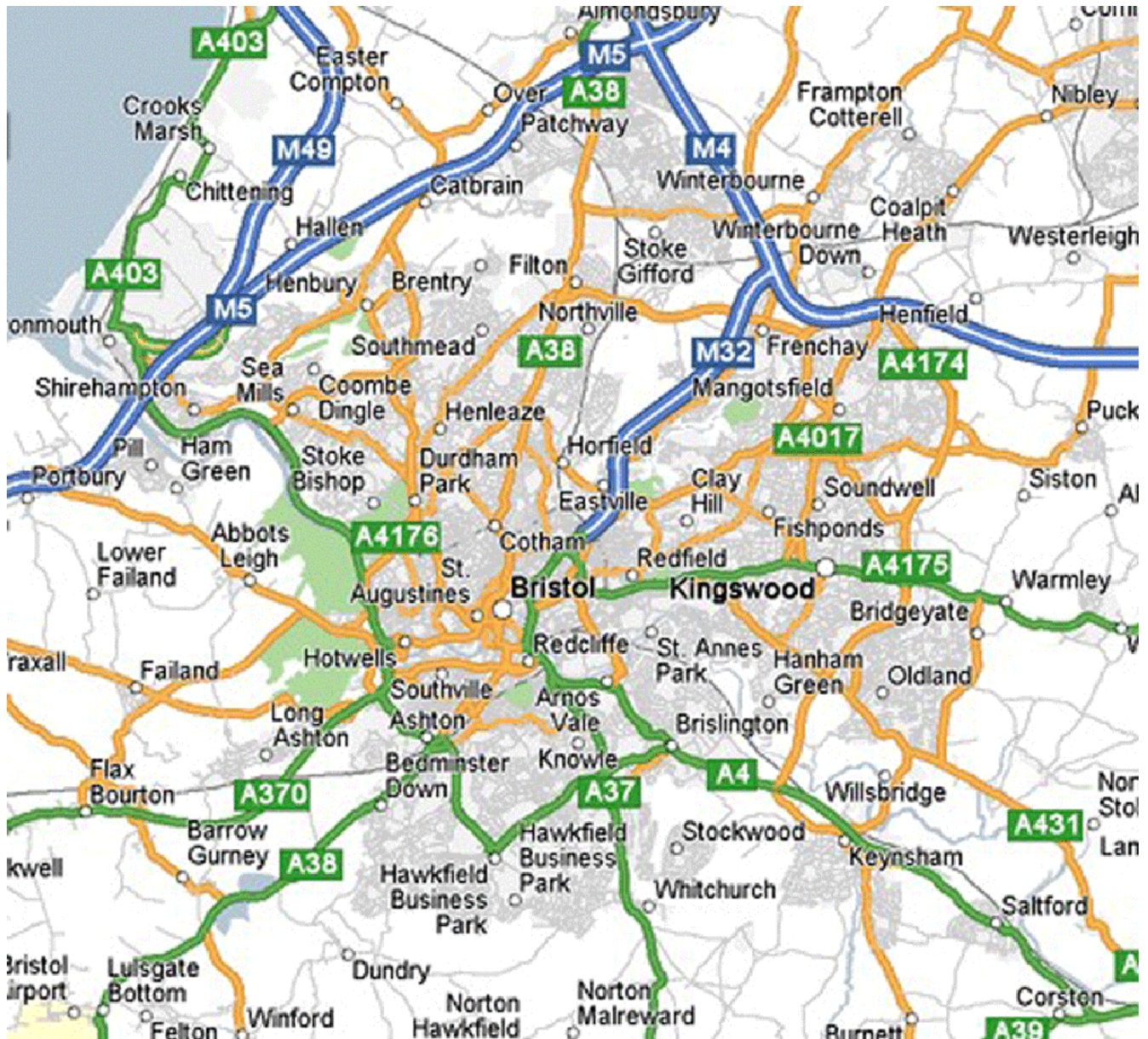
Figure 2. Map of Bristol and the surrounding areas indicating main arterial roads and small villages within the ALSPAC catchment area.

Whilst these older homes may look impressive and are certainly valuable, and the city remains a desirable place to live (Hawker, 2022), the ability to buy and run such large homes has meant that many have been split into flats/apartments or Houses of Multiple Occupation (HMOs). Due to complex preservation requirements (see Bristol City Council 2022a; Bristol City Council 2022b) and private landlords wishing to keep costs low, many of these buildings, in the historic heart particularly, remain under-developed with damp problems, inadequate heating and absence of double-glazing. Historic buildings are traditionally less energy efficient than new builds (Moran et al. , 2012). The lack of heat retention and rising