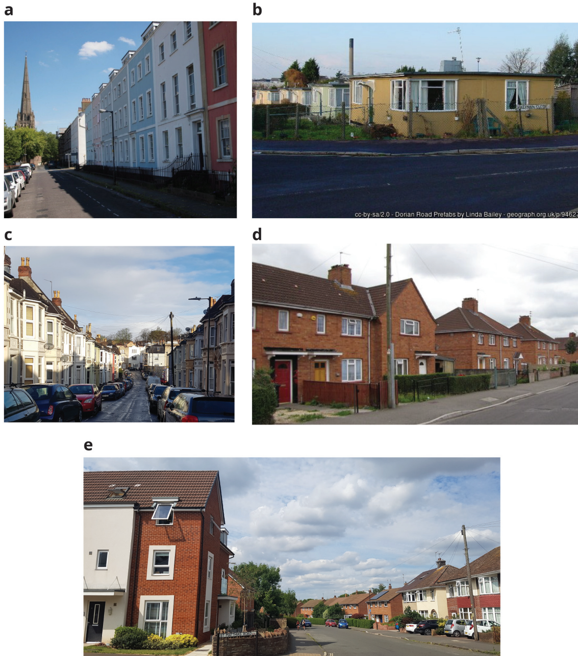
Figure 4. Typical Bristol housing (Top row, left: a. elegant Georgian terrace in central Bristol © David Hallam-Jones right: b. Prefab' homes © Copyright Linda Bailey. Bottom row, left: c. Victorian terraced street; right: d. 1930s Council housing © Copyright Jez McNeill; e. Bristol suburban street showing 1930s semi-detached homes, 1950s red-brick council housing (on right-hand side) and new builds on the left. (a, b, and d from https://www.geograph.org.uk/ and licensed for reuse under the Creative Commons Attribution-ShareAlike 2.0 Generic license (CC BY-SA 2.0), c and e both courtesy Y Iles-Caven, 2019 & 2022).