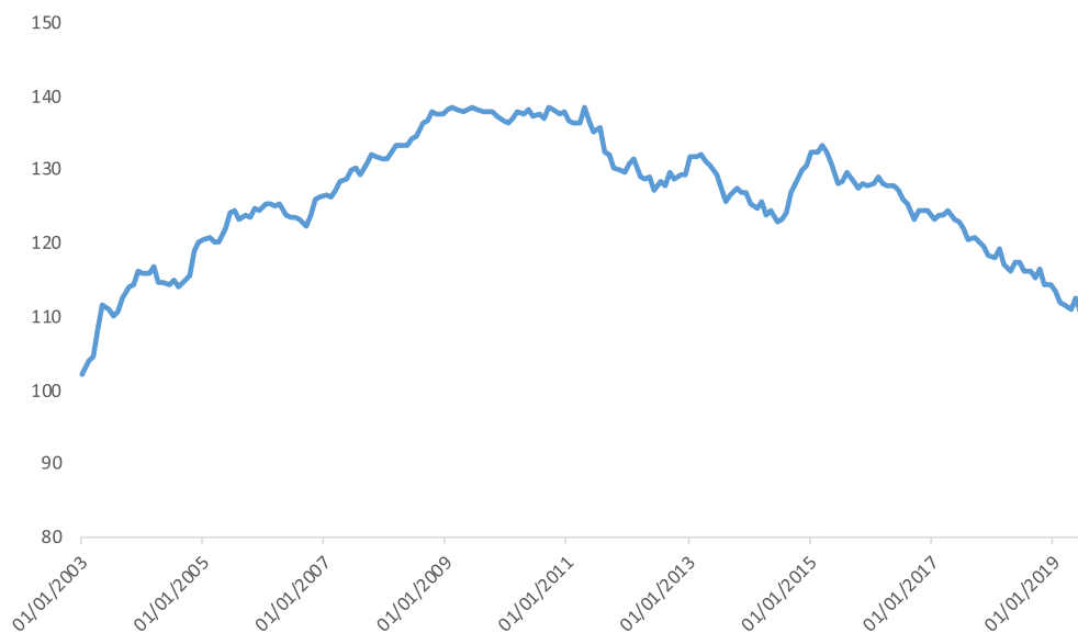
Fig. 1. FX Trading Strategy Performance. Panel A shows the cumulative return over the U.S. risk-free rate of (a) the equal-weighted portfolio of the G10 currencies (the grey line), (b) the equal-weighted portfolio of an MA(2) momentum strategy applied to the individual G10 currencies (the orange line) and (c) the MA(2) momentum strategy applied to the equal-weighted portfolio of G10 currencies (the blue line). The sample period is 01/1994 to 12/2020. The cumulative return is set to 1 in 12/1993 for all three strategies. Transaction costs are assumed to be zero. Panel B shows the Citi Parker Global Currency Index for the period 01/2003 to 08/2019. (For interpretation of the references to colour in this figure legend, the reader is referred to the web version of this article.)

the need to estimate a separate regression for each variable. Of course, the role of the individual currencies in predicting portfolio returns is readily backed out from that of the principal components.