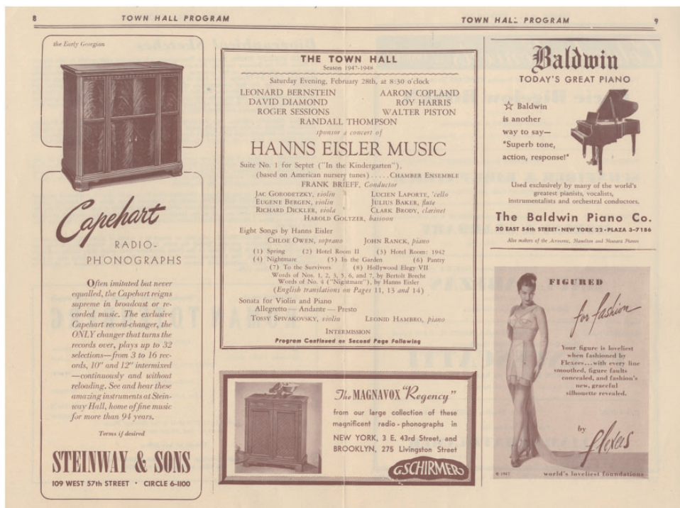
PL. 2. Programme, 'Hanns Eisler Music', Town Hall, New York City, 28 Feb. 1948. Hanns Eisler Archiv, Akademie der Künste, Berlin, call no. 3325

portrait of the composer among American colleagues: his supporters' names flank the published programme (see Pl. 2). 61 However, with its chamber suite based on American children's music and selections from the Hollywood Songbook , the concert paints a different portrait of Eisler, one without a trace of the Jewish internationalist who had been heralded in 1938. How fitting that the Reisesonate should be included on that evening's programme, emblematically bidding farewell to America for Eisler and thereby also signalling another migration!