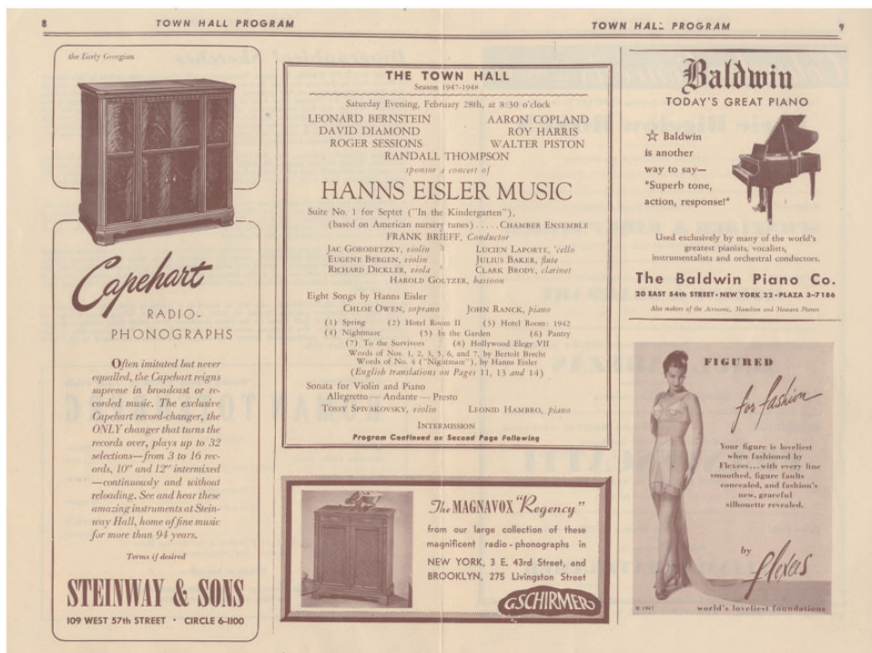
PL. 2. Programme, 'Hanns Eisler Music', Town Hall, New York City, 28 Feb. 1948.

portrait of the composer among American colleagues: his supporters' names flank the published programme (see Pl. 2). 61 However, with its chamber suite based on American children's music and selections from the Hollywood Songbook , the concert paints a different portrait of Eisler, one without a trace of the Jewish internationalist who had been heralded in 1938. How fitting that the Reisesonate should be included on that evening's programme, emblematically bidding farewell to America for Eisler and thereby also signalling another migration!