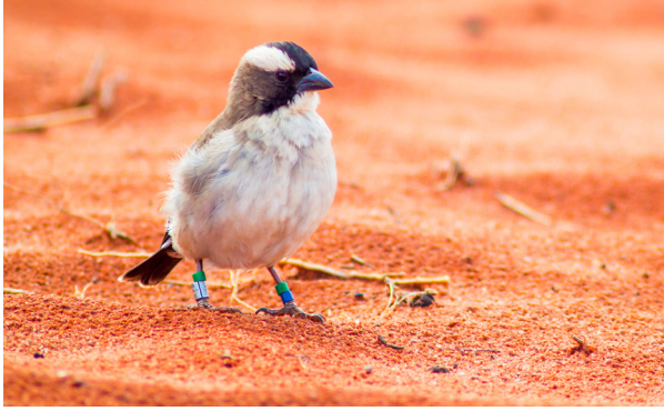
Figure 1. A male white-browed sparrow weaver, Plocepasser mahali , in Tswalu Kalahari Reserve, South Africa.

not successfully caught after song recording on day 1 (both of which had been assigned to the PHA treatment) and so these males have been excluded from all analyses. Four males were not successfully recorded at dawn on day 2 (one PHA, three PBS), and so could not be included in the analysis of the song response to immune challenge. Seven males (three PHA treated, four PBS treated) evaded capture on evening 2, and so could not be included in the analysis of the body mass response to immune challenge. Final sample sizes are provided for each analysis in the Results.