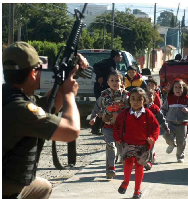
Schoolchildren fleeing drug-related violence in Tijuana, Mexico

Throughout Latin America, but also in Central Asia and West Africa, long-running civil wars and decades of poor governance have been exacerbated by the war on drugs. An estimated 95% of illicit drug production occurs in such areas, and trafficking from and across them is made easier by their chaotic environment. 22