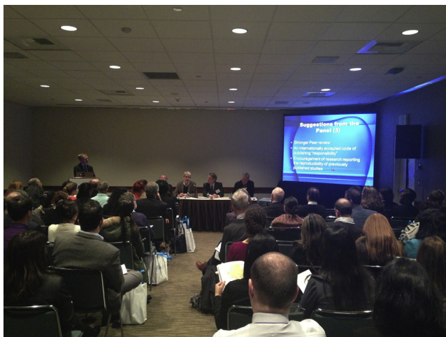
Fig. 1 – Professor Eaton (standing) leads the discussion at the Seattle Meeting.

We have a lot of baggage from the past but let us go forward into the future with good ideas and let's see collectively in the next 55 minutes what we can achieve (Figs. 1 and 2).