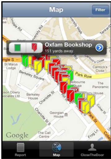
Figure 1. Map interface of the Close the Door app.